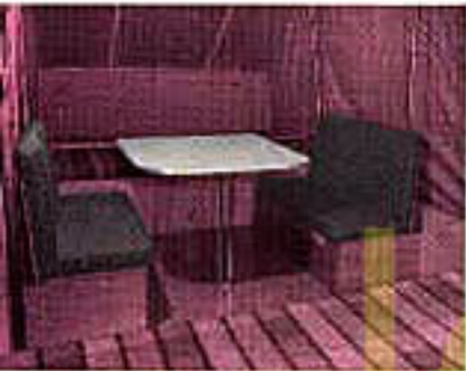
TABLE and CUSHIONS: Large 35" x 45" table of fiberglass construction, may be used outside of the camper or inside. Converts into a third bed at night. The cushions are full 3-inch thick polyfoam, vinyl covered, and convert into a lounge when the table is outside. Standard equipment in the Catalina; optional in other models.

PORTABLE KITCHEN UNIT: Consists of two burner propane stove with tilt-up shield, 12' rubber hose with fittings, sink with basket, drain hose, double action hand pump with hose and 5 gallon portable water tank. May be used with all models; standard equipment on Catalina. May be used inside during inclement weather or outside, under the canopy, during fair weather. Lightweight, sturdy and easily moved about.