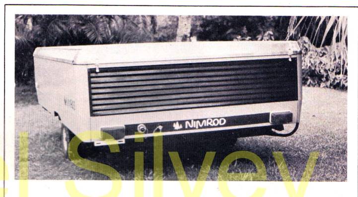
PRICES AND SPECIFICATIONS

The Nimrod has eight big, fully screened windows for all-around ventilation. Two, one at each end of the trailer, are picture windows, 48 x 29 inches and 53 x 36 inches; these also